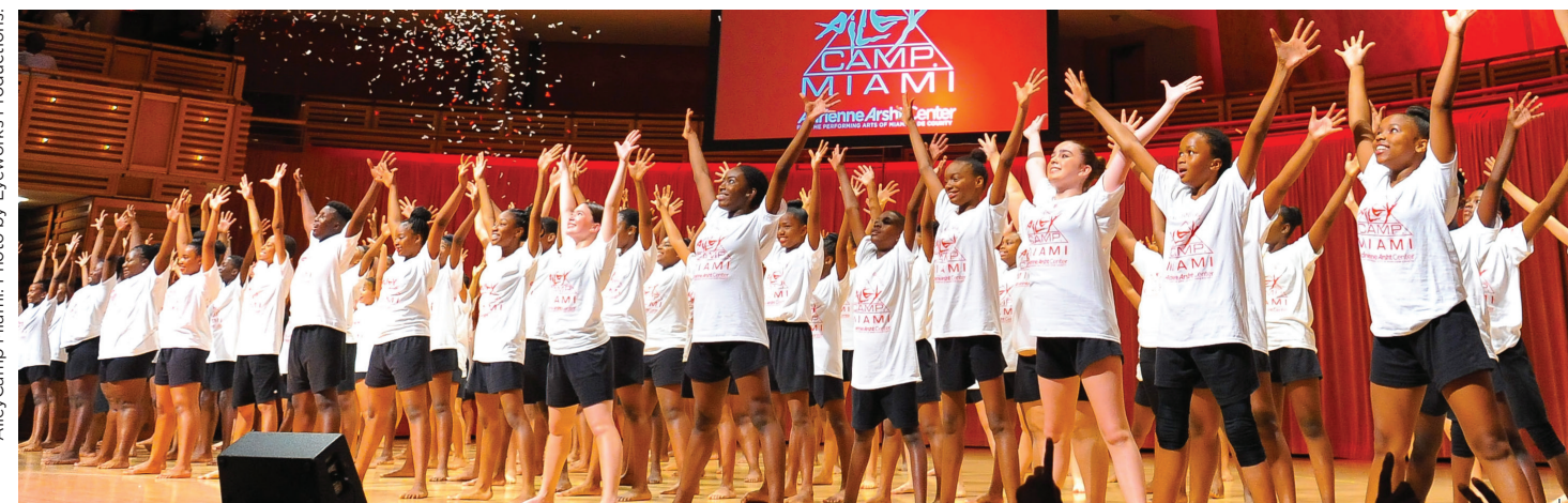
AileyCamp Miami.

ACCESSING THE ARTS provides arts education for 300 K-12 students with disabilities every school year. The Center sends teaching artists into public school classrooms to share movement, music and drama lessons while improving students' communication skills, verbal expression, creative thinking, math concepts, fine motor skills and diversity acceptance. Each session culminates with a performance at the Arsht Center.